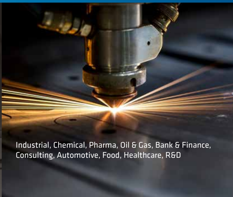
Industrial, Chemical, Pharma, Oil & Gas, Bank & Finance, Consulting, Automotive, Food, Healthcare, R&D